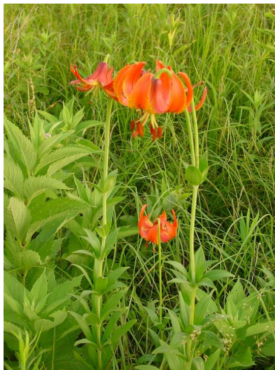
Lilium michiganense at Hayden Native Prairie, Iowa

A "Certificate of Appreciation" will be given at the 2019 Central Region Convention to all that participated.