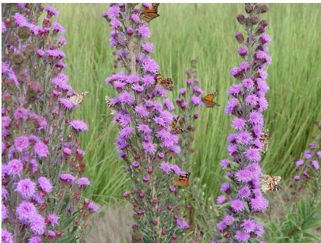
Liatris aspera and Monarchs at Hayden Native Prairie, IA