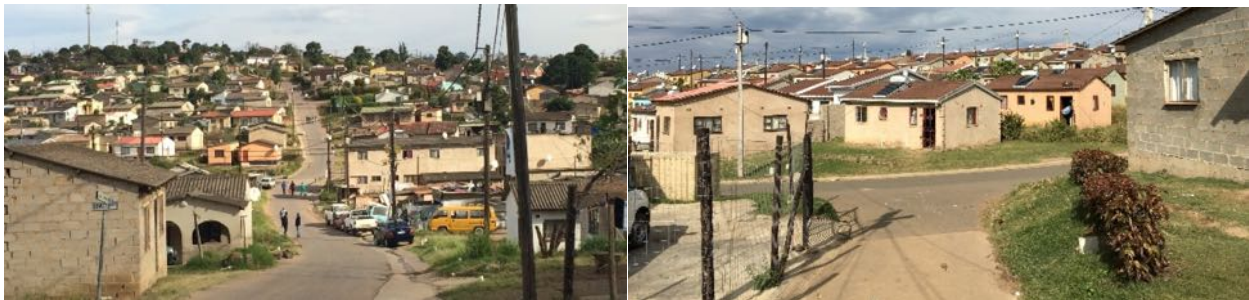
Case studies: Piesang River (L) and Namibia Stop 8 (R) in Durban

Across Africa, informal settlements struggle with poor housing, limited services and environmental hazards. Despite an increasing emphasis on participatory upgrading, communities are often constrained by lack of resources or technical knowledge to lead these processes, particularly when urban policies are designed and implemented without a clear understanding of local conditions. ISULabaNtu seeks to support communities by strengthening their capacity to guide urban development themselves. With a focus on Durban Metropolitan Area, South Africa, ISULabaNtu is undertaking research, capacity building and community mapping, in collaboration with residents, to feed into the creation of an integrated environmental and construction management toolkit. The project is also exploring how findings can be applied elsewhere. These activities are not only building the capacity of residents on community-led approaches to construction management and service provision, but also promoting the creation of partnerships with other stakeholders such as local businesses, policy makers and academics.