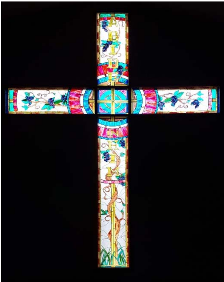
Picture of a new stained glass window at the Drumheller Church of the Nazarene

Please register at https://www.eventbrite.ca/e/frost-festival-2019-tickets-54561684467 "