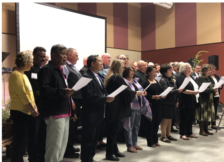
The Elders Choir ministering at the Ordination Service.