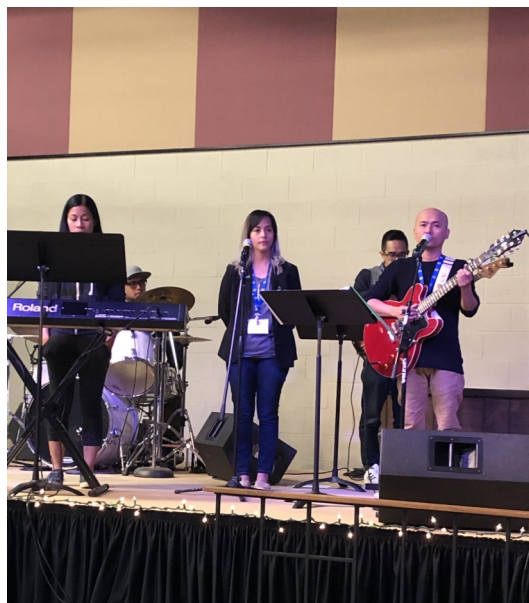
The “River of Life” church worship team leading the congregation in praise to our Lord.