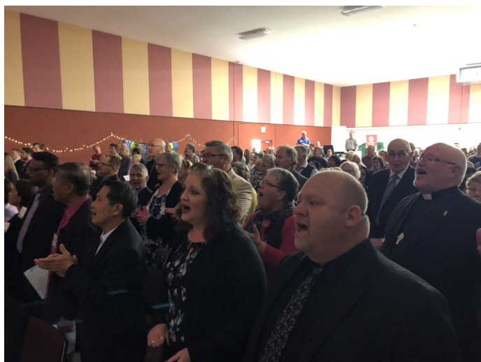
Congregation during the ordination service.