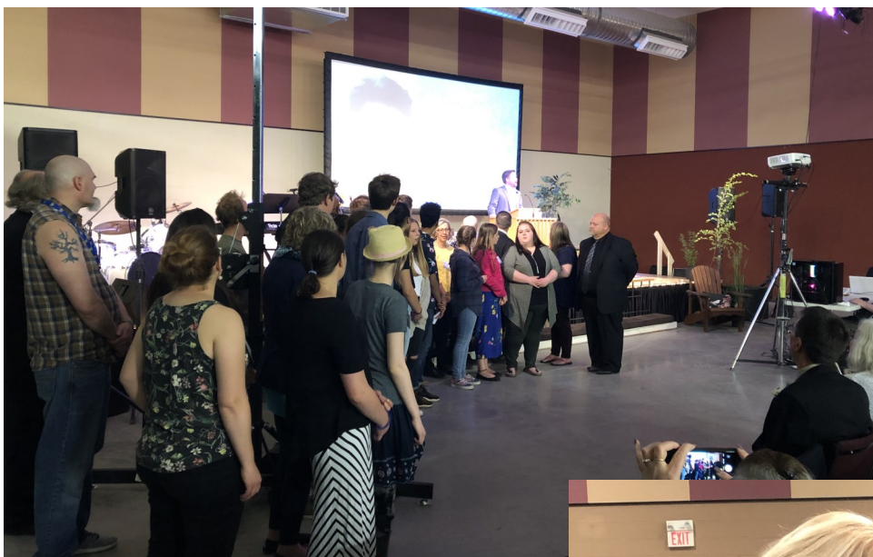
Prayer for the young people and sponsors who will attend Nazarene Youth Congress in Phoenix in July.