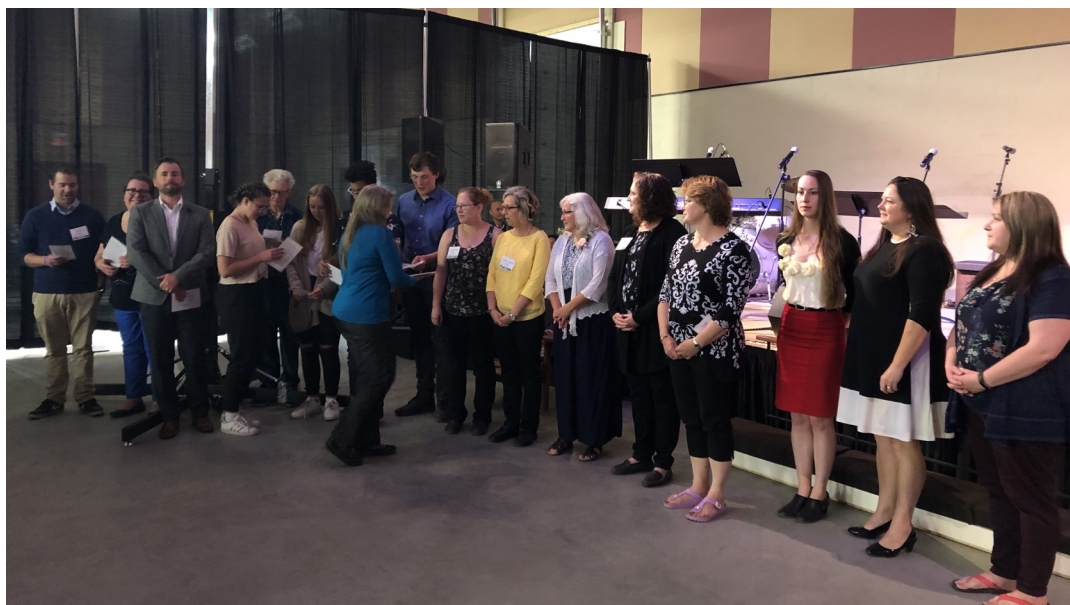
The commissioning Service for the leaders of N.Y.I., SDMI & NMI.