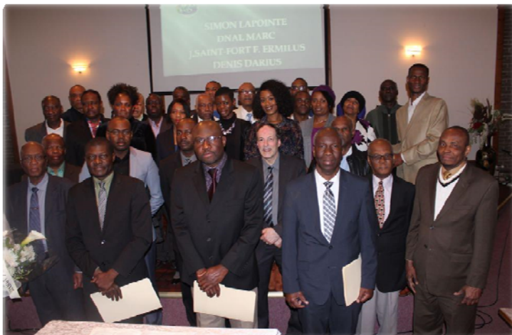
Instructors and graduate students of the IBNQ