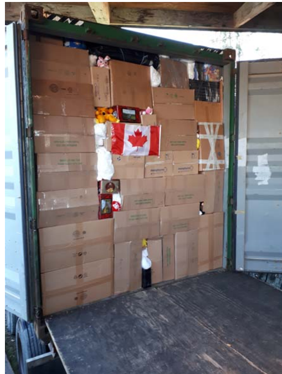
Back of load