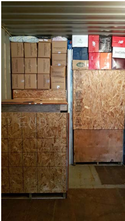
Cuba tools and gleaners food

Volunteers at CRW worked hard to assemble and pack tools, hardware, Gleaners soup mix, educational supplies, household goods and linens and some bikes. Also included was some medical equipment to assist with a local clinic. Some volunteers unloaded vehicles, others sorted while some packed boxes, and others provided food for all.