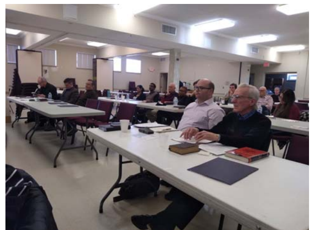
Pastors learning together at Clergy Day