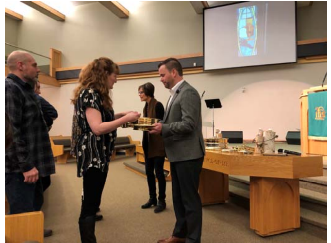
The Celebration of the Lord's Supper.