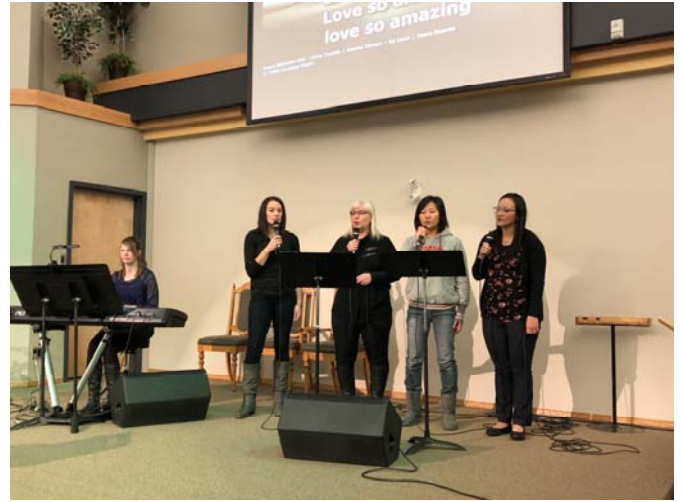
The Wainright Worship team.