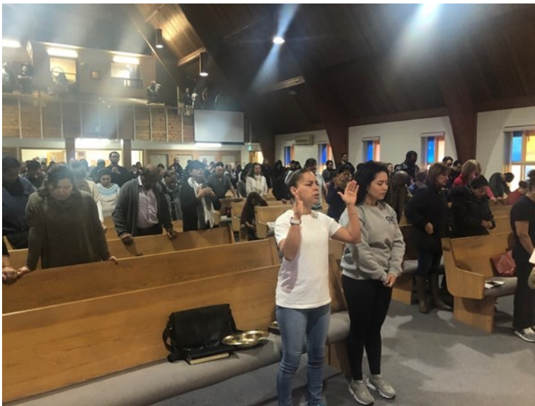
November 2 nd Toronto Emmanuel Spanish Church hosted the GTA Missional Zone Prayer Gathering. It was a powerful time in the presence of God.

The District Superintendent and District Advisory Board are taking the initiative by planning corporate times of prayer across the district.