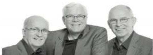
The New Trademarks

7 PM - Special Music - The New Trademarks