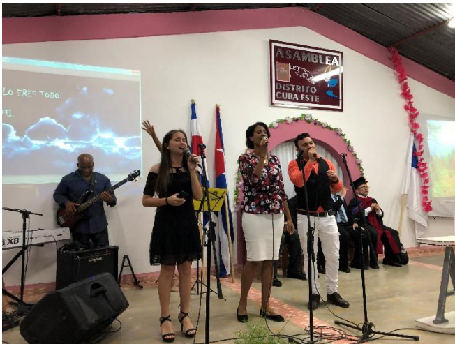
The worship team from Holguin Central Church of the Nazarene