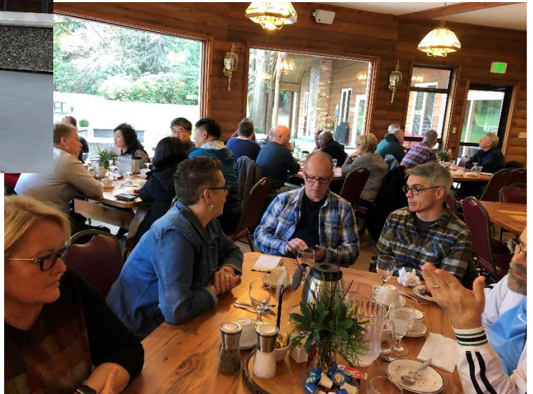
Enjoying the great food at Cedar Springs.