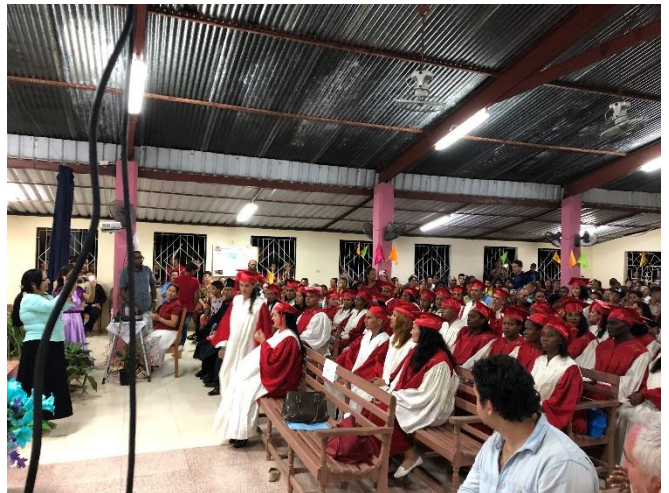
Some of the graduates preparing for the ceremony.