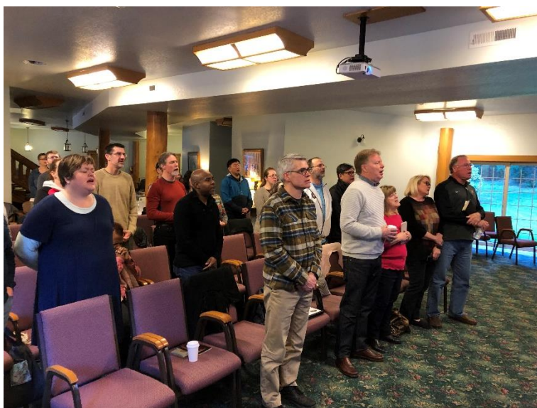
Some of the pastoral families gathered in worship.