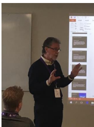
National Director sharing the "Vision" with Canadian NYI Leaders at "CONNECT"