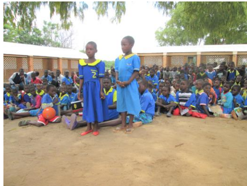
Children at Zukuma Nazarene school

Two of the eight classes of students meet outdoors as there is no classroom for these older children. NCM Canada is funding the construction of a classroom building. Construction will begin this month. Follow our NCM Canada newsletters for details.