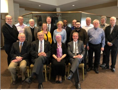
National Board, staff and invited guests at the recent Annual Meeting in Toronto (8th-10th April, 2018)