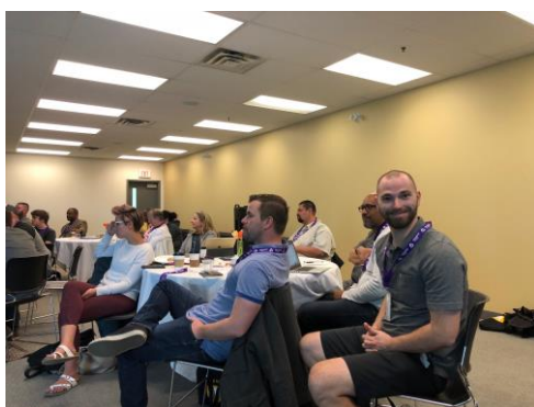
Some of the Youth Leaders from across Canada in attendance...