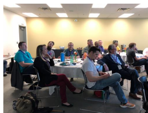
More of our Youth Leaders in attendance...