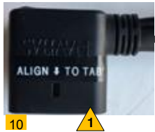
20 POS Molex TSX Connector