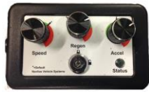
Navitas PN: 10-000686 OnTheFly Programmer