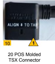
20 POS Molded TSX Connector