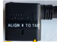
20 POS Molded TSX Connector