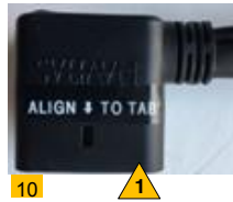
20 POS Molded TSX Connector