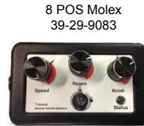
Navitas PN: 10-000686 OnTheFly Programmer

24 POS Molex 39-28-1243 P1: (CP8) Key P2: (CP5) Charger Interlock P3: NA P4: (CP10) Logic Power P5: (CP10) Logic Power P6: (CP10) Logic Power P7: (CP10) Logic Power P8: (CP17) Foot Switch P9: NA P10: (CP7) FWD In P11: (CP6) REV In P12: (CP10) Logic Power P13: (CP18) GND Poly P14: (CP18) GND Poly P15: ITS Throttle - P16: NA P17: (CP20) Line Contactor P18: NA P19: Buzzer P20: NA P21: NA P22: NA P23: NA P24: NA CP=Controller Pinout