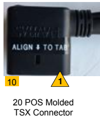
20 POS Molex TSX Connector