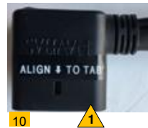
20 POS Molded TSX Connector