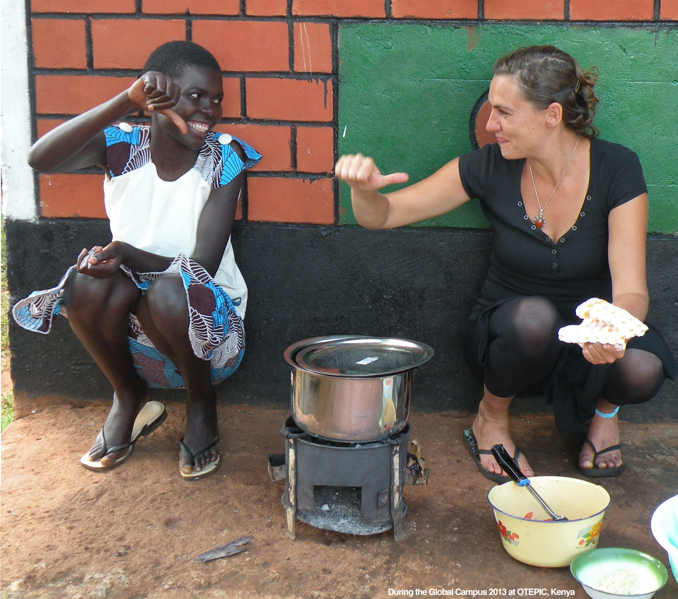
During the Global Campus 2013 at OTEPIC, Kenya

“RECONCILIATION CAN ONLY HAPPEN WHEN A BASE OF EQUALITY AND SOLIDARITY IS CREATED THROUGH THE MUTUAL ACKNOWLEDGMENT OF OUR TRUE NATURE.”