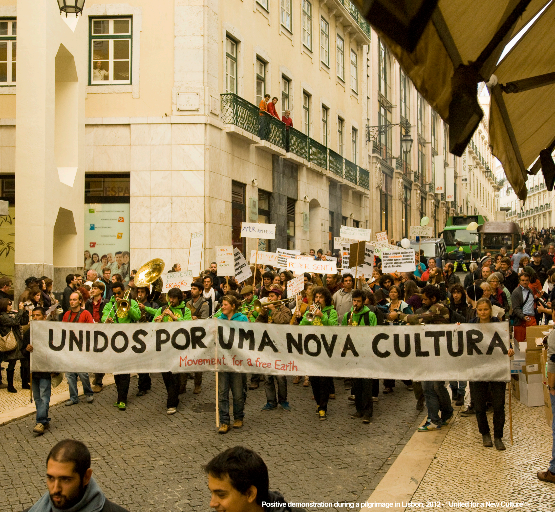
Positive demonstration during a pilgrimage in Lisbon, 2012 - "United for a New Culture"

"IT IS NO LONGER ABOUT FIGHTING THE EXISTING SYSTEMS, WHICH WILL BREAK DOWN BY THEMSELVES. IT IS MUCH MORE ABOUT KNOWING THE NEW DIRECTIONS AND CREATING PLANETARY BASE STATIONS FOR THEM."