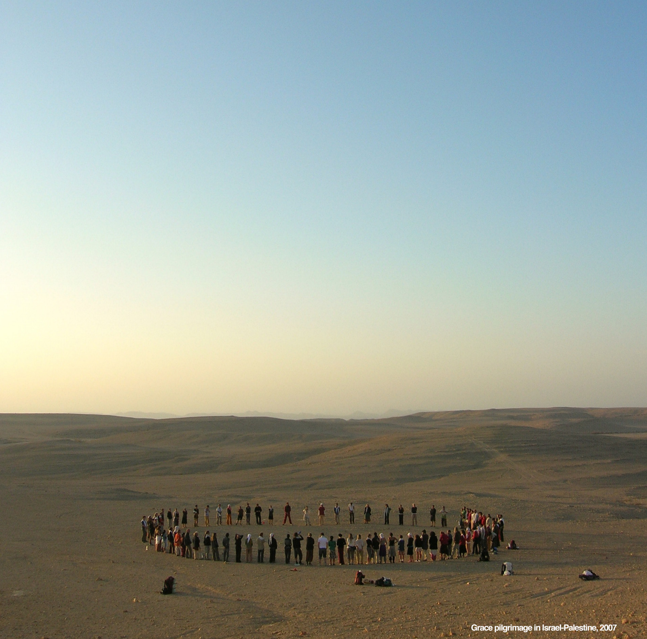
Grace pilgrimage in Israel-Palestine, 2007

“YOU CAN JUDGE WHETHER THE THOUGHTS YOU ARE THINKING AND THE THINGS YOU ARE DOING ARE RIGHT FOR YOU: HAVE THEY BROUGHT YOU INNER PEACE?”