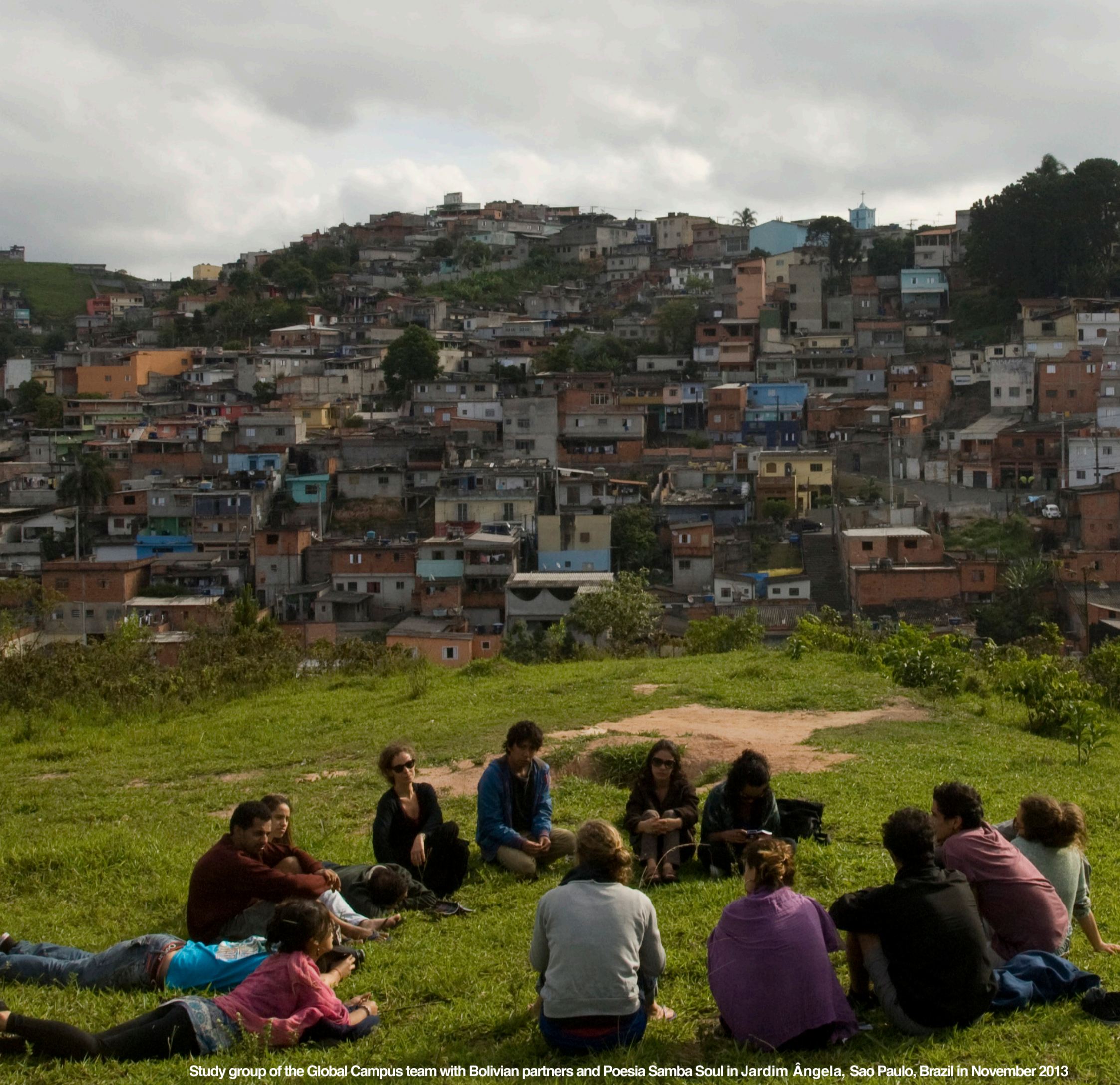
Study group of the Global Campus team with Bolivian partners and Poesia Samba Soul in Jardim Ângela, Sao Paulo, Brazil in November 2013

“THERE IS THE WORLD THAT WE CREATE, AND THERE IS THE WORLD THAT HAS CREATED US. THESE TWO WORLDS MUST COME TOGETHER. THAT IS THE GOAL OF OUR JOURNEY.”