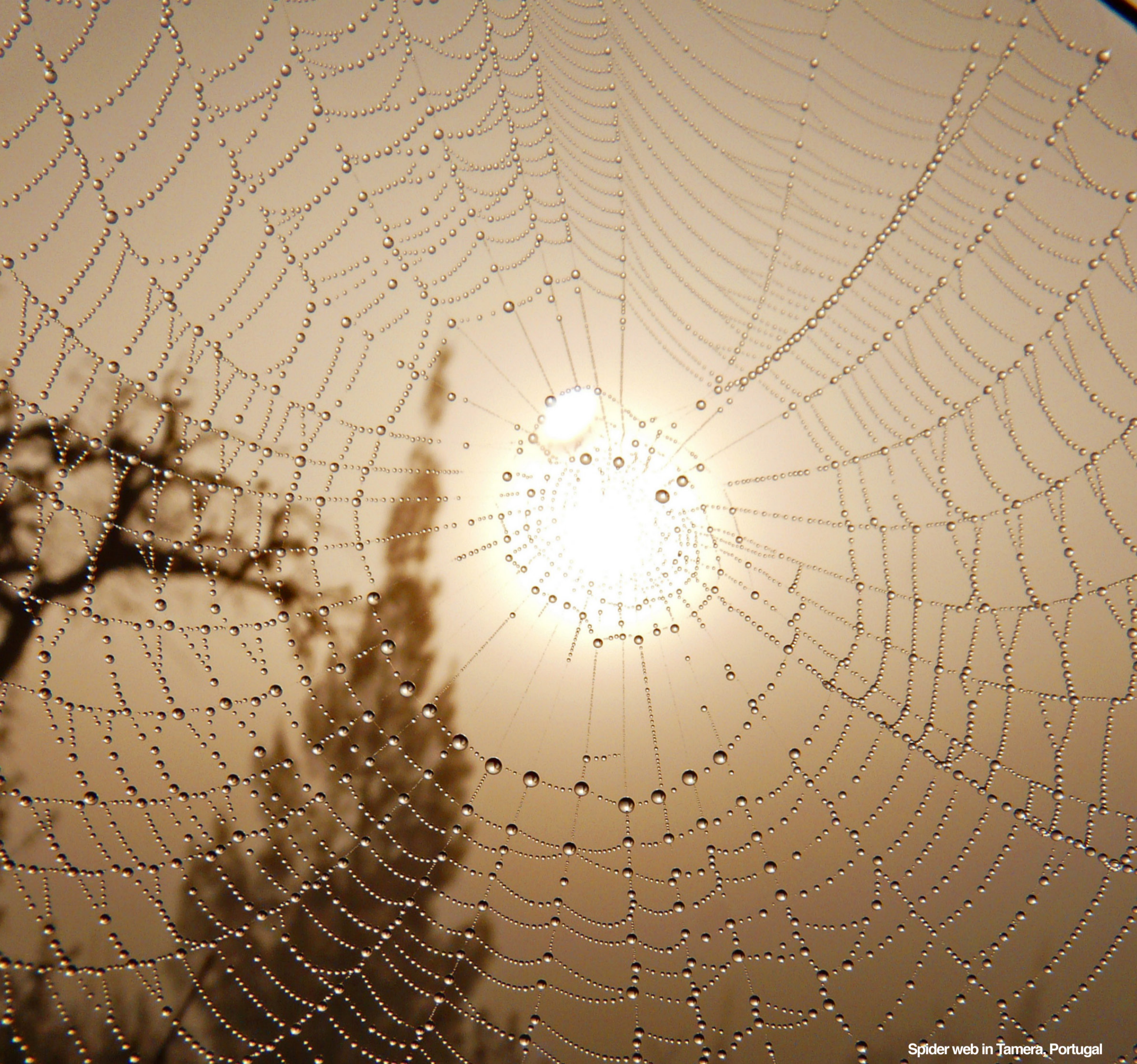
Spider web in Tamera, Portugal

“MAY A GLOBALWIDE PEACE, WHICH IS STRONGER THAN ALL VIOLENCE, EMERGE FROM THE COHERENCE OF ALL PEACE MOVEMENTS.”