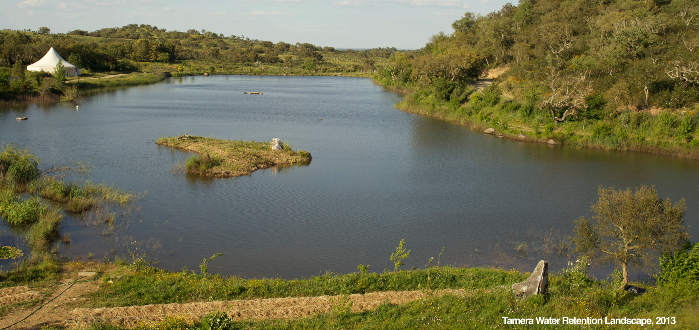
Tamera Water Retention Landscape, 2013

“FOOD, WATER AND ENERGY ARE FREELY AVAILABLE FOR ALL OF HUMANITY IF WE FOLLOW THE LOGIC OF NATURE AND NOT THE LAWS OF CAPITAL.”