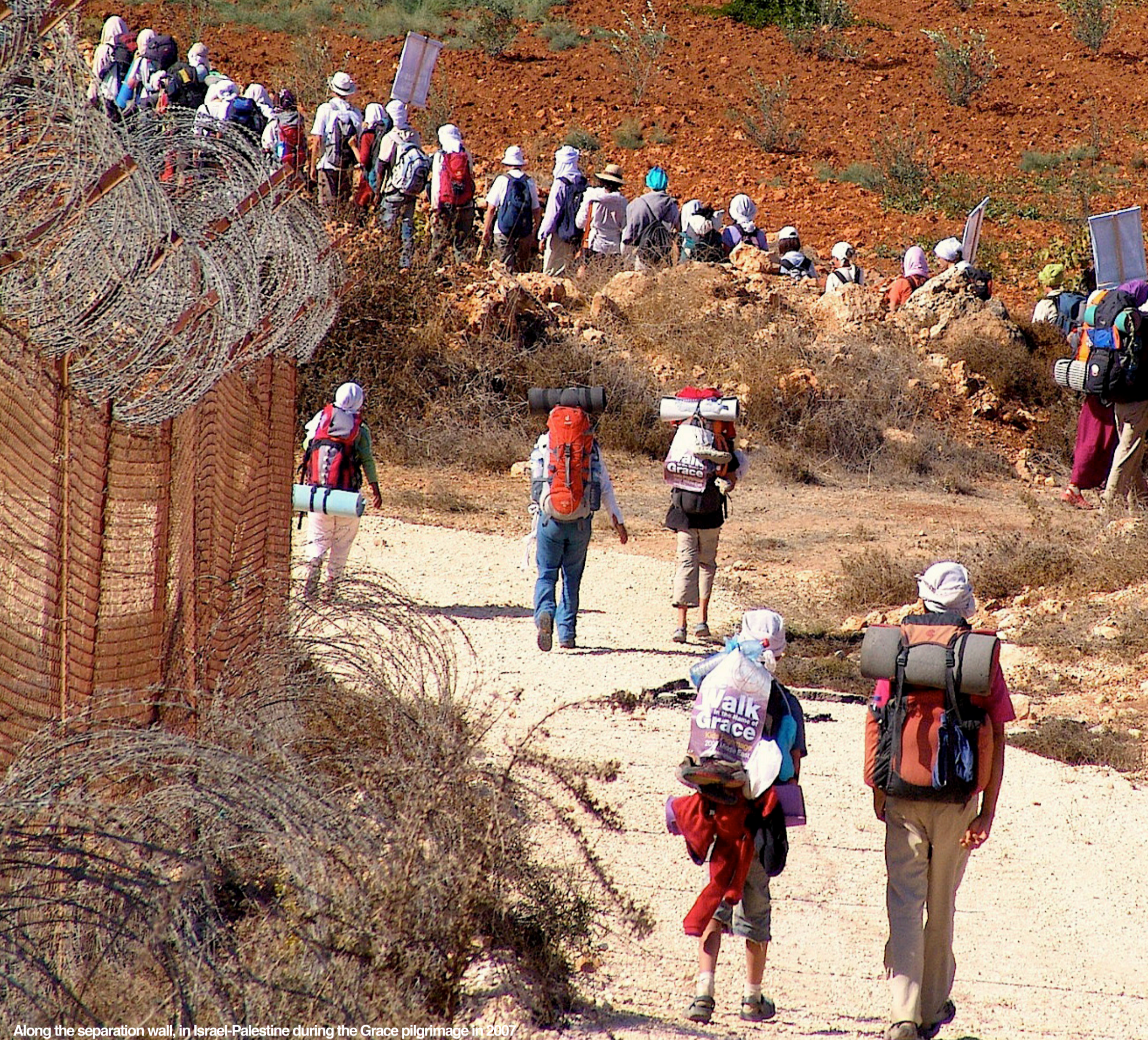
Along the separation wall, in Israel-Palestine during the Grace pilgrimage in 2007

“ONCE YOU HAVE SEEN THE MISERY OF THE WORLD WITH MY EYES, YOU WILL NO LONGER WAIT. YOU WILL ACT WHEREVER YOU CAN.”