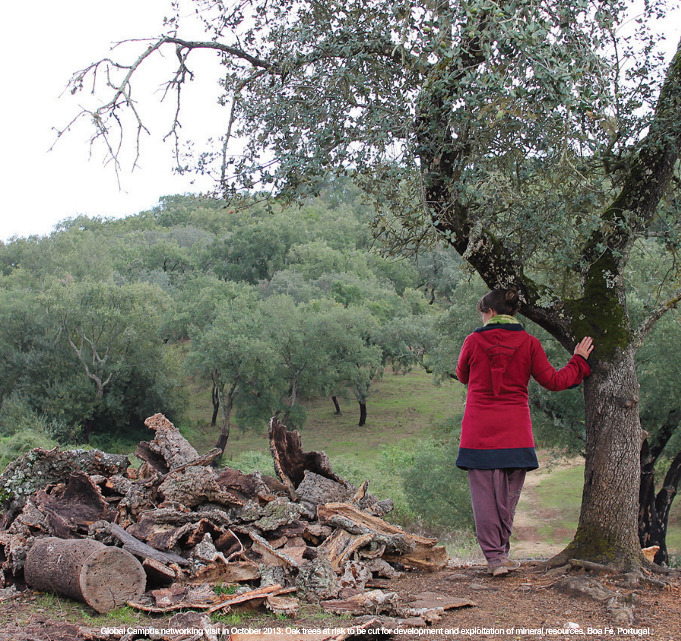
Global Campus networking visit in October 2013: Oak trees at risk to be cut for development and exploitation of mineral resources, Boa Fé, Portugal

“A UNITED PEOPLE, CONNECTED THROUGH FRIENDSHIP AND THE SHARING OF KNOWLEDGE, IN POSSESSION OF HEALTHY AND DECENTRALIZED CONDITIONS OF PRODUCTION, UNIFIED BY A HEART-ANCHORED UNIVERSAL ETHIC – WILL NEVER BE DEFEATED.”