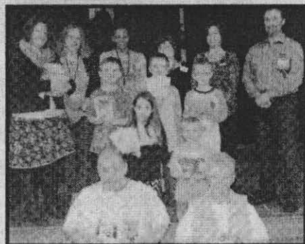
Students at Watsonstown Elementary School recently signed holiday cards, which will be distributed to residents at Watsonstown Nursing and Rehabilitation Center and to active military members through the Holiday Mail for Heroes program. Participating in a recent presentation of