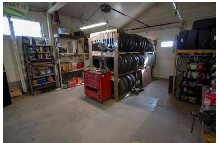
TIRE RACK & REAR OVERHEAD DOOR