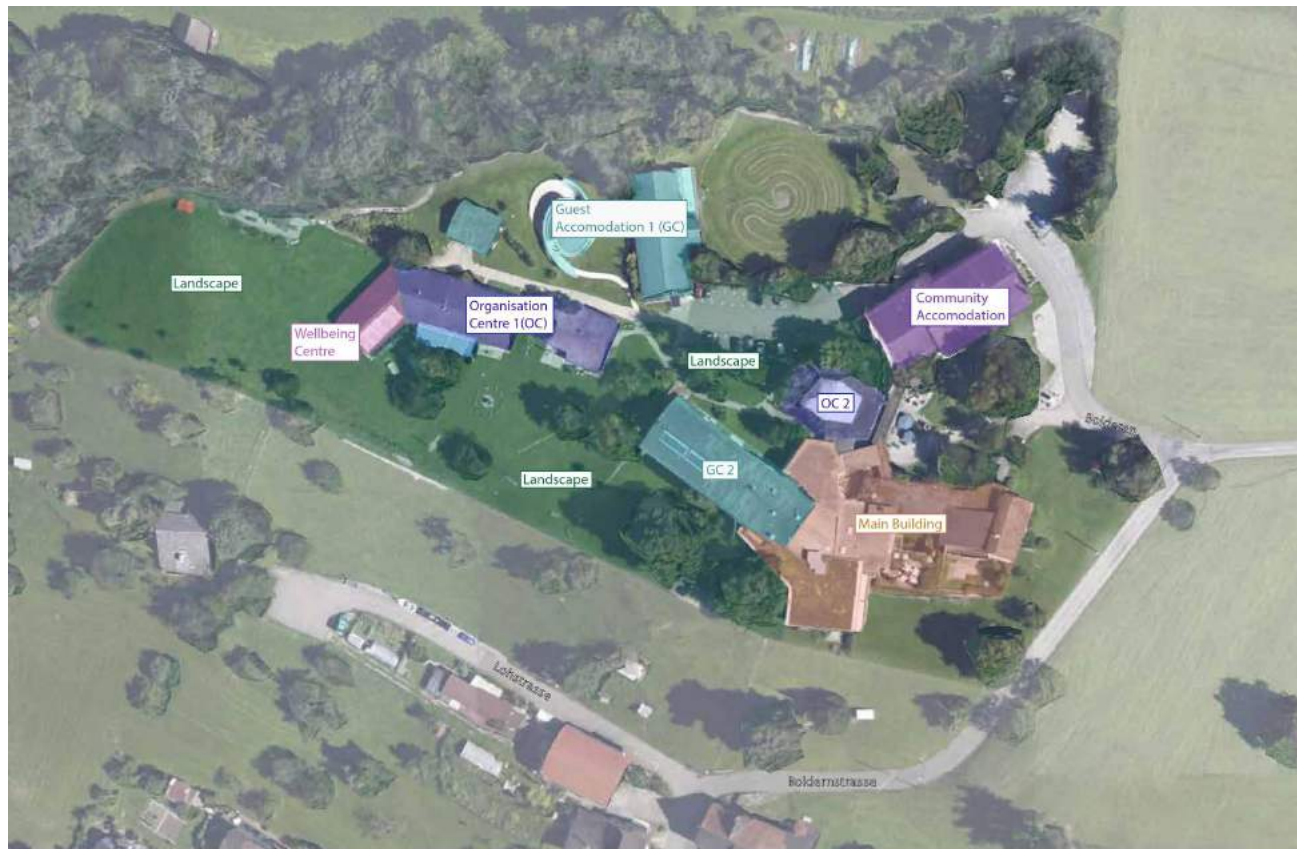
Integration Zurich Retreat into the existing infrastructure