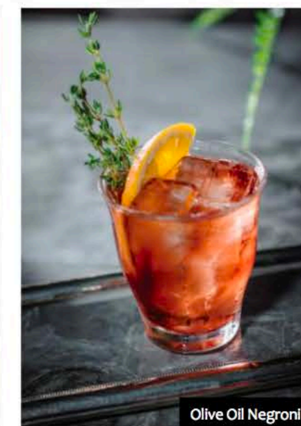
Olive Oil Negroni