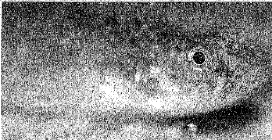
Tidewater goby ( Eucyclogobius newberryi )

Making space at the Aquarium for the tidewater goby is a win-win: A home for the at-risk fish...and living proof of our threatened waterways.