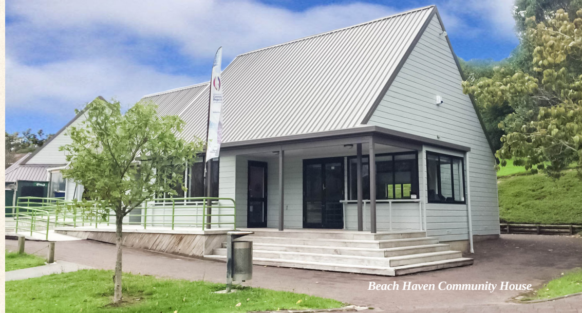
Beach Haven Community House

Beach Haven community House is set in the beautiful Shepherds Park, 130 Beach Haven road, within walking distance of the Beach Haven shops. Shepherds Park has large green spaces and a playground in-view of the house. The house itself has 3 great spaces available for hire. See our website for more information.