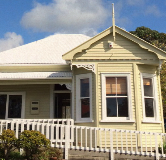
Birkdale Community House

Facilities are also available outside these hours.