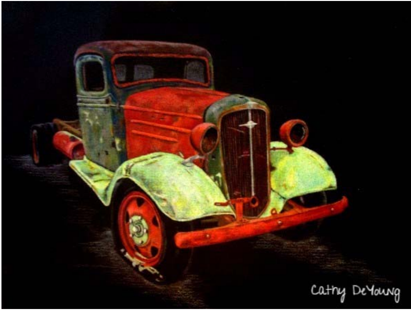
Primary Workshop April 14