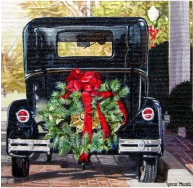
Christmas Card Workshop June 4, 11, 18, 25