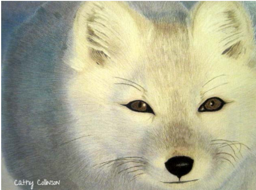
White on White Workshop September 8