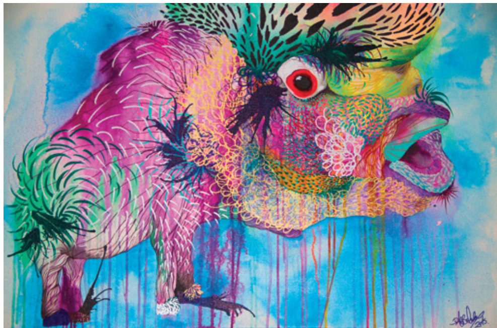
Rosa Inflada Mixed Media on Canvas 24" x 36"