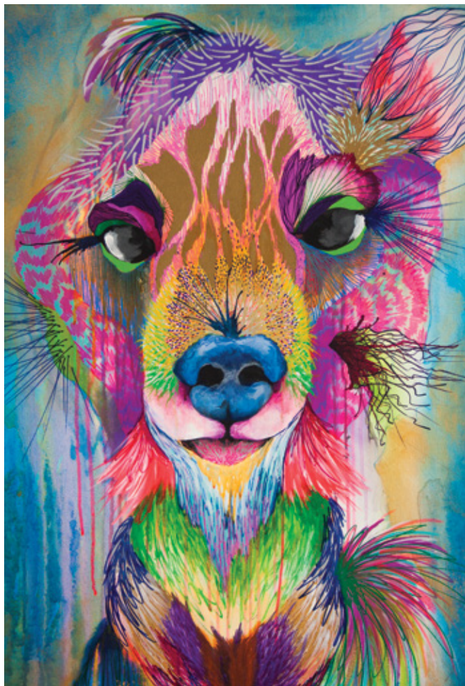
Blanca Elena Mixed Media on Canvas 39" x 31.5"