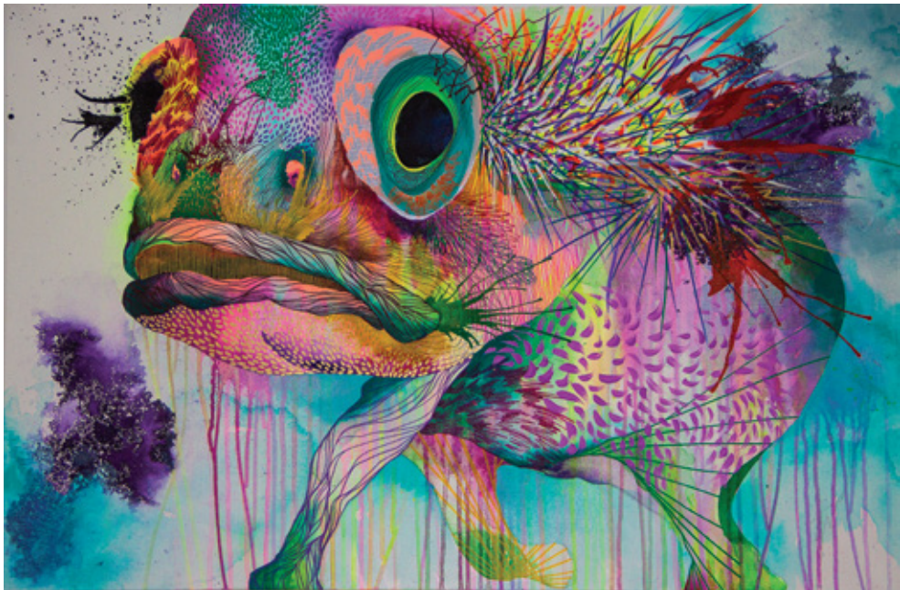
Pepe Coral Mixed Media on Canvas 24" x 36"