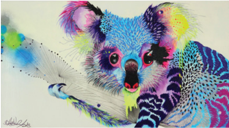
Max Koala Mixed Media on Canvas 35.5" x 20"