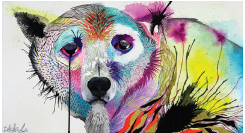
Ruco Polar Mixed Media on Canvas 35.5" x 20"