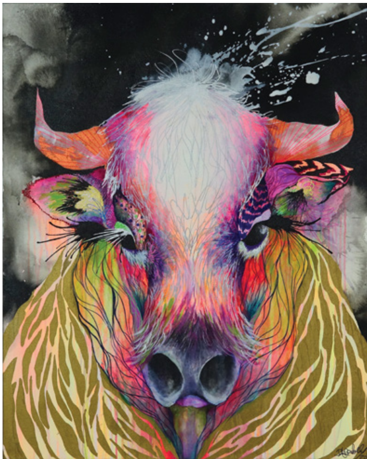
El Billy Mixed Media on Canvas 39" x 31.5"