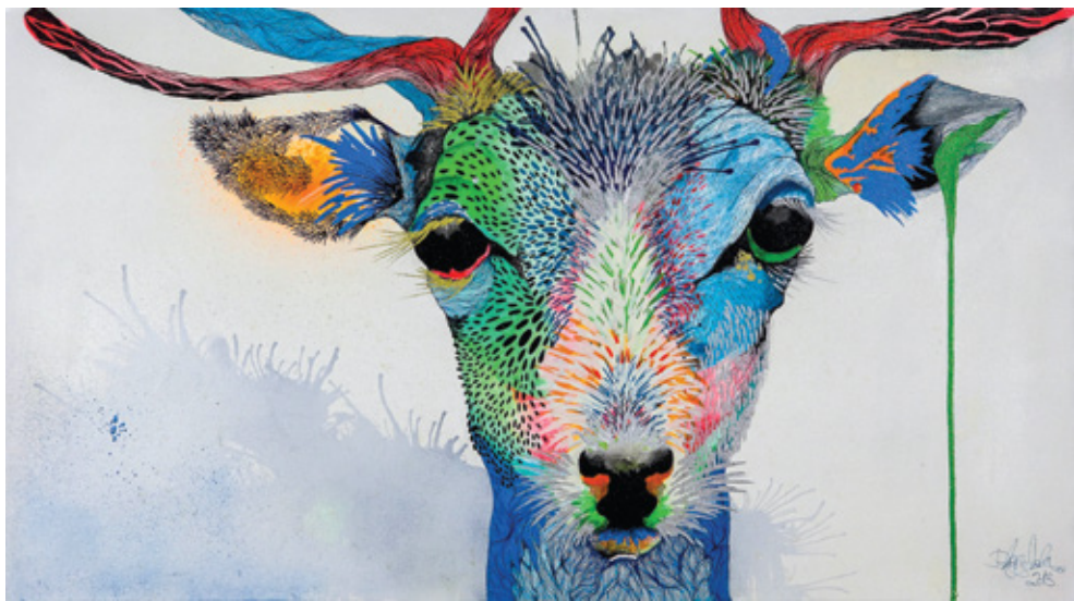
Albino Mixed Media on Canvas 35.5" x 20"