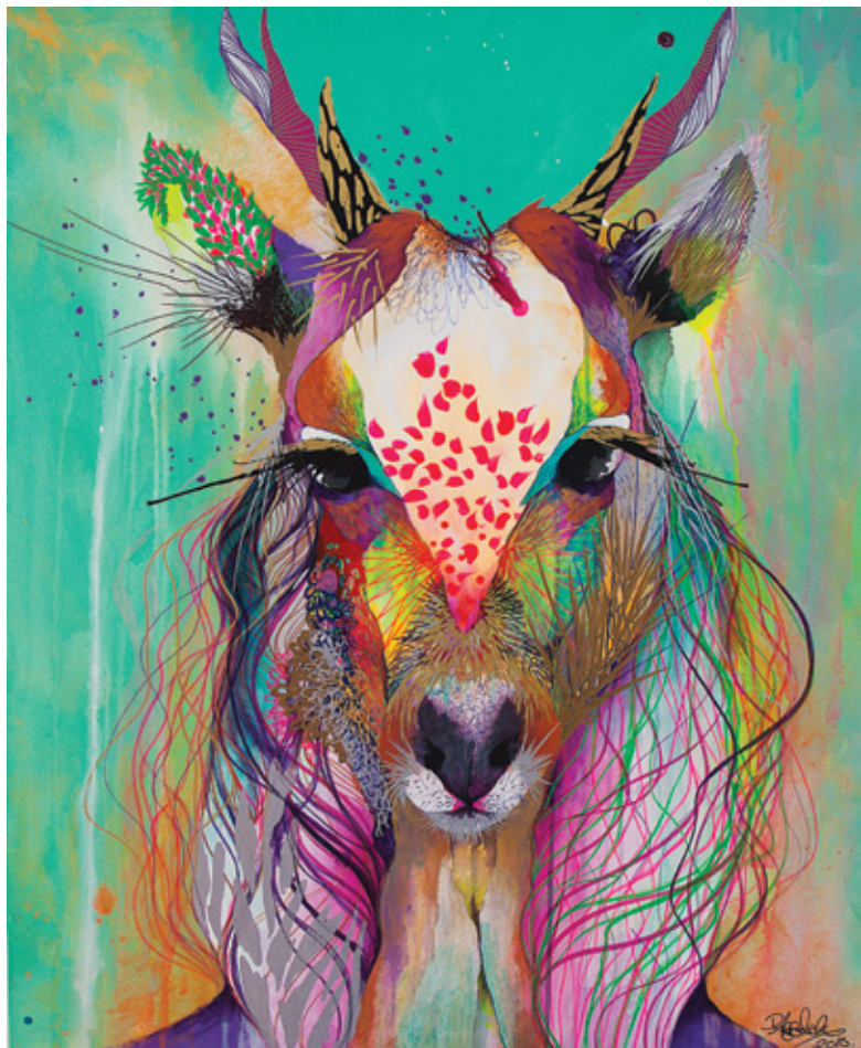
Clementina Mixed Media on Canvas 39" x 31.5"