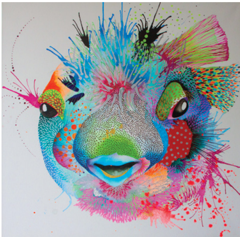
Cherry Blow Mixed Media on Canvas 35.5" x 23.5"