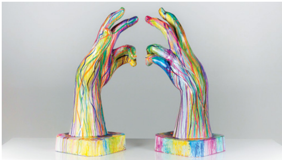
Plastic Universe Automotive paint on fiberglass