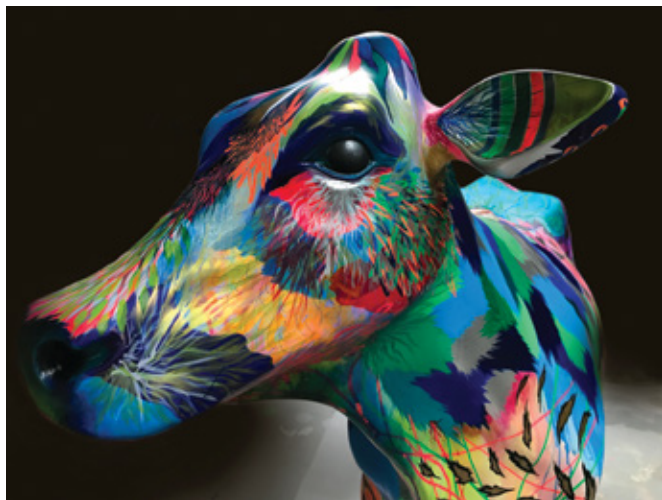
Don Gastón Automotive paint on fiberglass 64" x 84"x 26"