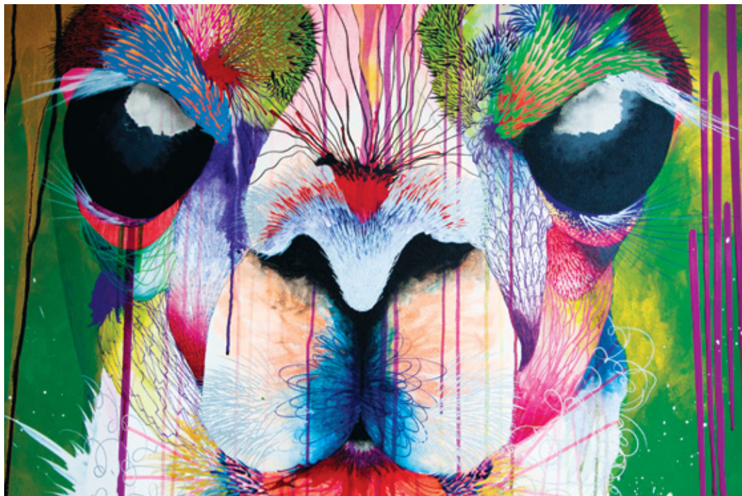
Llama Ñañita Mixed Media on Canvas 79" x 39"