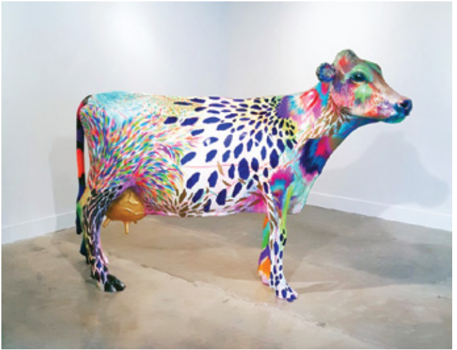
Doña Norma Automotive paint on fiberglass 64" x 84" x 26"