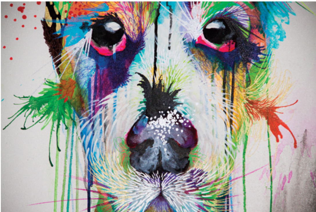
Cansancio tus ojos Mixed Media on Canvas 47.5" x 20"