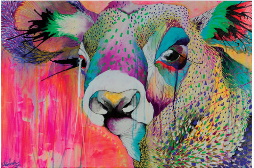
Torettillo Expectante Mixed Media on Canvas 35.5" x 23.5"