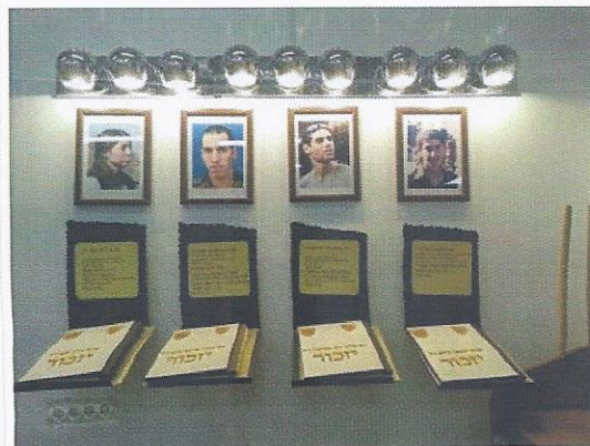
The heritage site of the Field Intelligence Corps