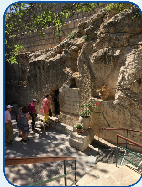
The Garden Tomb – this is believed to be the Tomb of Joseph of Arimathea; where Jesus was buried, and 3 days later resurrected.

and support the Jewish people. As having Jewish roots in my family, and having faith in Yeshua my heart yearned to make my way to Israel. Our dreams were fulfilled and expanded by seeing the monumental landscape and history of Israel. I myself felt more connected to God and his people. As Americans, it is vital we pray for Israel and become advocates for God's people. I encourage you to go back and read the Old Testament and see the prophecies that are being fulfilled each and every day in Israel and in our lives.