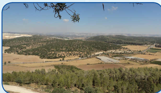
The Valley of Elah (the location of the battle of David and Goliath)