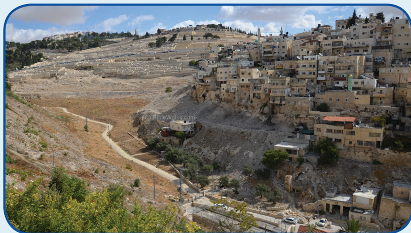
The Mount of Olives (where Jesus ascended into Heaven & will return) Kidron Valley, and the City of David