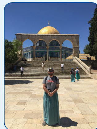
Dome of the Rock / Temple Mount