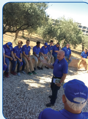
Our group on the Mt. of Olives