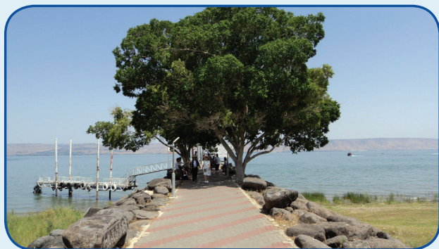
The Sea of Galilee