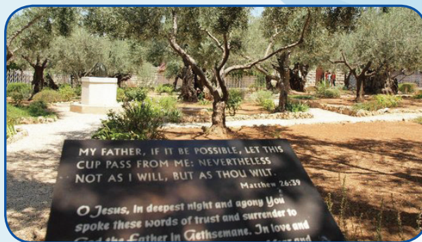
The Garden of Gethsemane