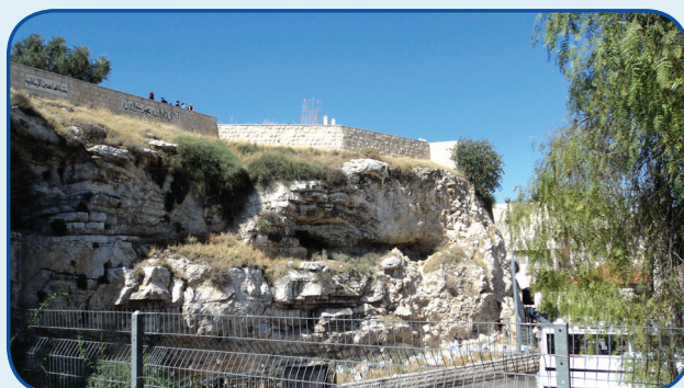
Golgotha (the location where Jesus was crucified)