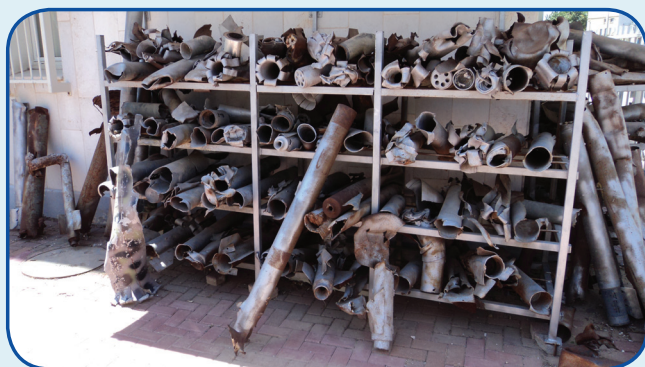
Empty rocket shells launched at Israel from Gaza