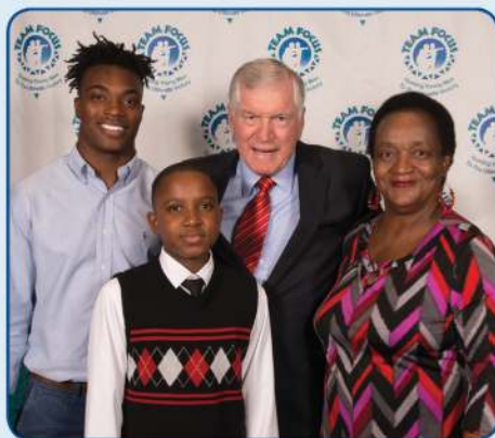
Pictured is Former NFL Football Player Lee Roy Jordan with two Team Focus members and their mom.