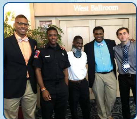
Pictured are Team Focus Mobile Alumni/Members at the Banquet.