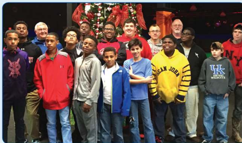
Pictured is the Team Focus Kentucky Chapter Christmas Party.

Creator: Adobe InDesign CS5.5 (7.5) Last Modification: D:\20160607084524-05-00\ Producer: Adobe PDF Library 9.9 Creation Date: D:\20160607084403-05-00\ 2540.0 dpi (Screened Data File POS, Right-Reading, Color-Setup, Std-CVP 8/Unaltered Spot Colors) : TRAP ABO:100 Seal-Ing Percent: 3T 100 WD 100 \rs\l\luc\ PS Version: 3015.102 RGN Version 8.3 Revision 1 RST, Ripped on Tuesday, June 07, 2016 8:46:30 AM ID: L0R1: