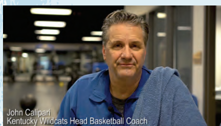
John Calipari Kentucky Wildcats Head Basketball Coach