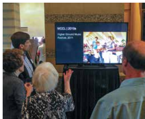
Left: MCCL's multi-faceted history was documented in a slide show.