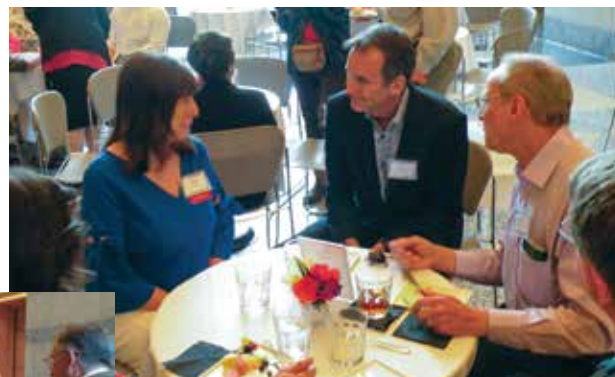
Former Gov. Tim Pawlenty spent the evening talking with guests and MCCL staff.