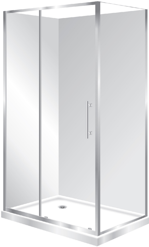
Pictured - Stellar 2 Panel Slider Silva LEFT HAND SKU 283989