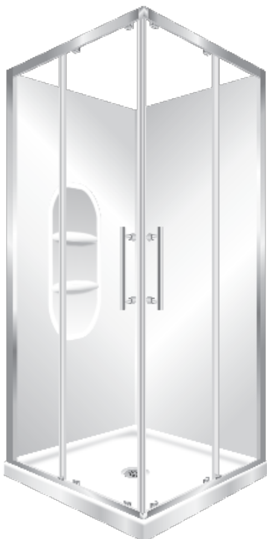
Pictured above - Stellar Twin 90 Square 9x9 Silva Door Moulded Wall SKU - 248542