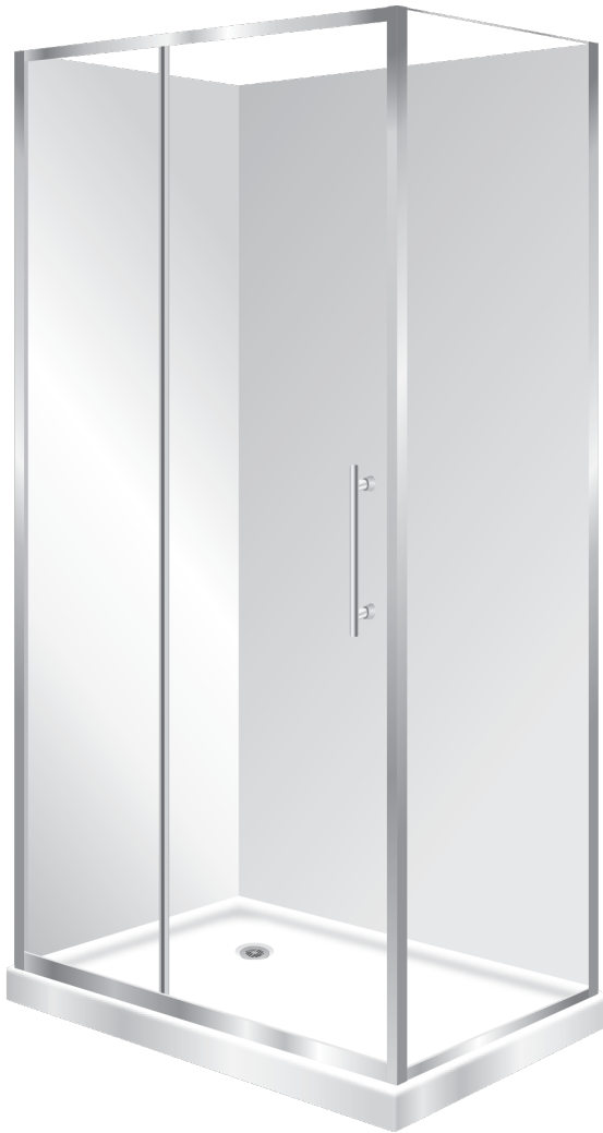
Pictured Above - Stellar Capricorn RH Silva Door, Flat Wall