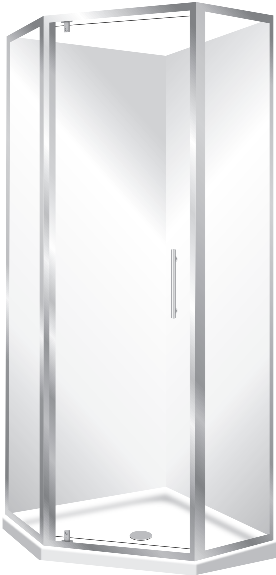
Pictured above - Stellar 9x9 Angle Corner, Silva Door, Flat Wall SKU 248513