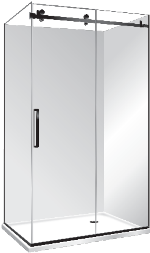
Pictured - Stellar Luxury BLACK EDITION 12 x 1 2 sided RIGHT HAND. SKU 318630