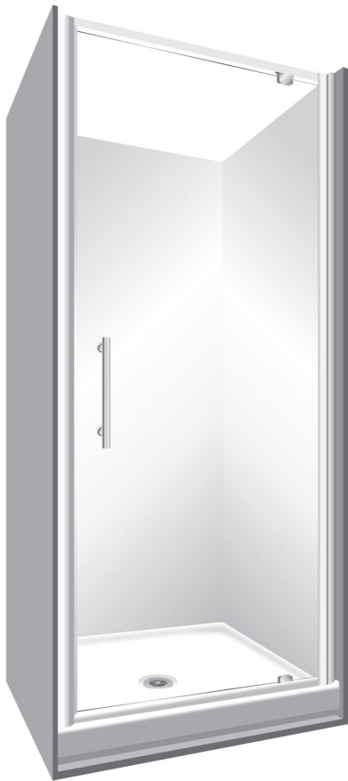
Pictured above - Stellar 900 x 900 3 sided Alcove. Flat Wall, Silva SKU 248509