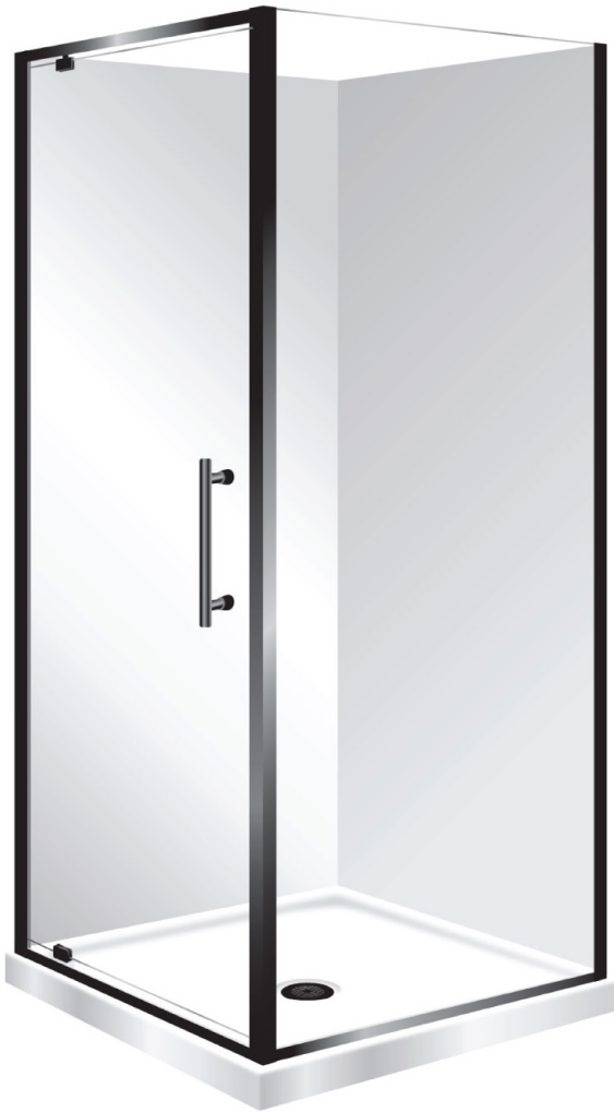
Pictured Above - Orion Square 1x1 Pivot Door Black Flat Wall