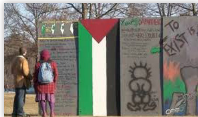
Anti-Israel "Apartheid Wall" display, which is taken to North American college campuses.

While BDS has made inroads in Europe, the most important battlegrounds today are in the U.S. (and Canada), where BDS has launched a multi-pronged attack.