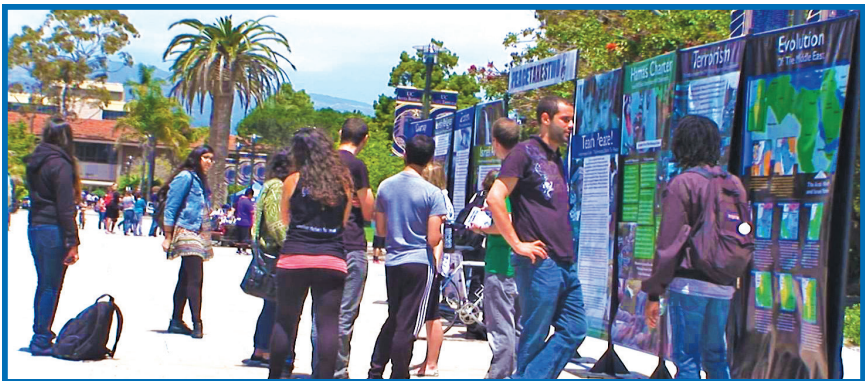
StandWithUs "Israel Matters" Display, which travels to North American college campuses to educate students about Israel.

Finally, we must defeat the bigoted BDS movement through legal means. States like South Carolina and Illinois have already moved in this direction.