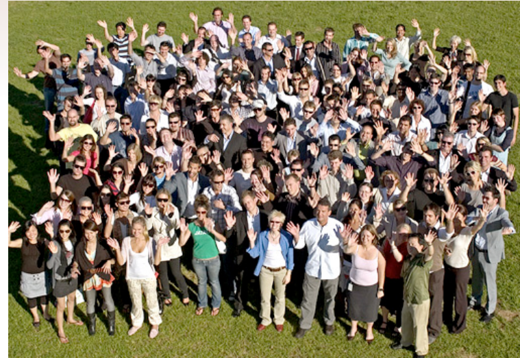
(This photo is not of the half sibling group of 200. It does show 200 people, so that we can see what 200 half siblings might look like as a group!)

78% ... think that sperm donors should be restricted from donating at multiple banks.