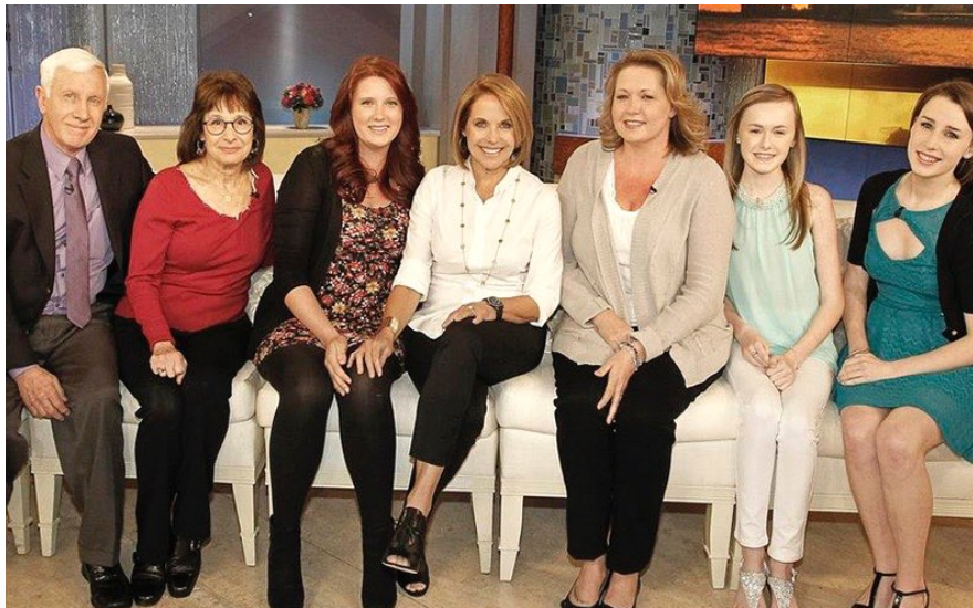
Blended family: Egg donor and her 2 daughters meeting her 16 year old egg donor-daughter, with her parents on the Katie Couric Show 2014

83% ... of offspring who are not in contact with their donors, wish to be.