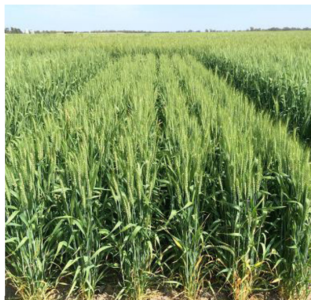
LRPB Oryx Irrigated production Mayrunga NSW