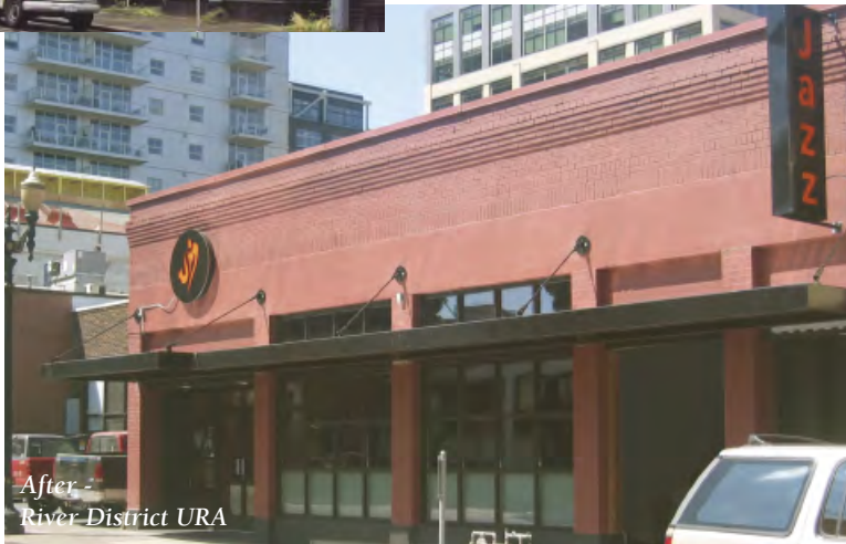
After - River District URA