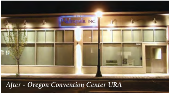
After - Oregon Convention Center URA