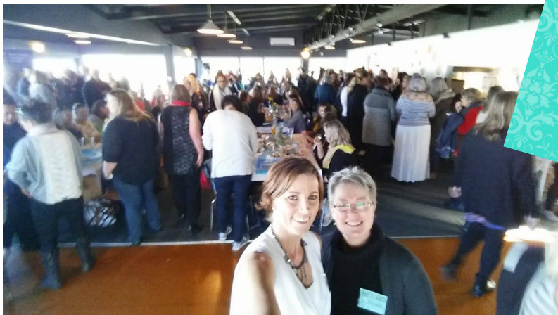
150 women fundraising for women with cancer