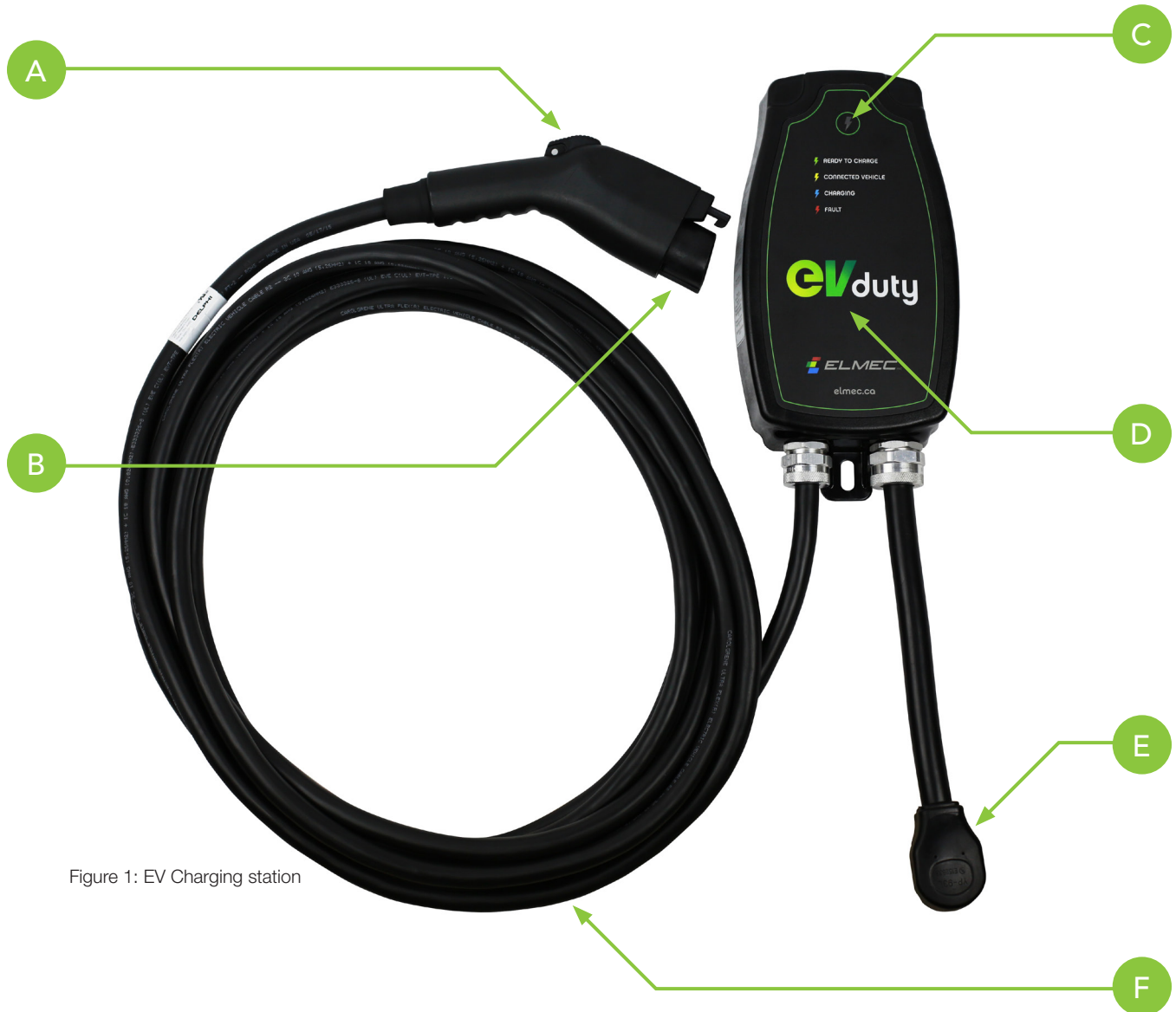
Figure 1: EV Charging station

The EVduty EVC30 series is a Level 2 Electric Vehicle Charging Station. Its primary function is to send electrical power to an Electrical Vehicle that is equipped with the SAE J1772 Electric Vehicle connector. Here are the main parts of the product