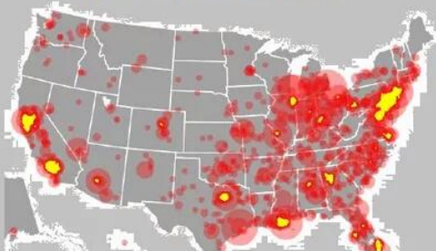
AREAS OF GUN CRIME