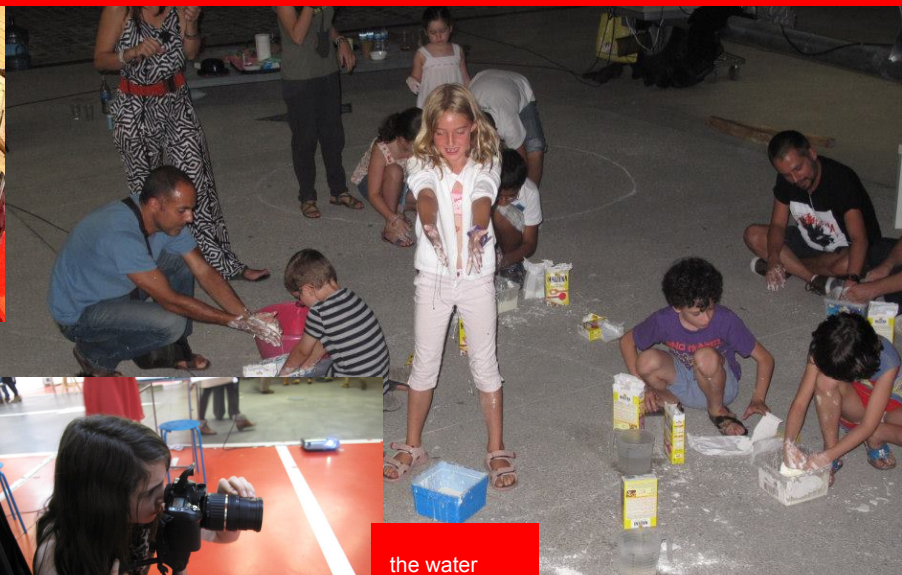
the water molecule workshop