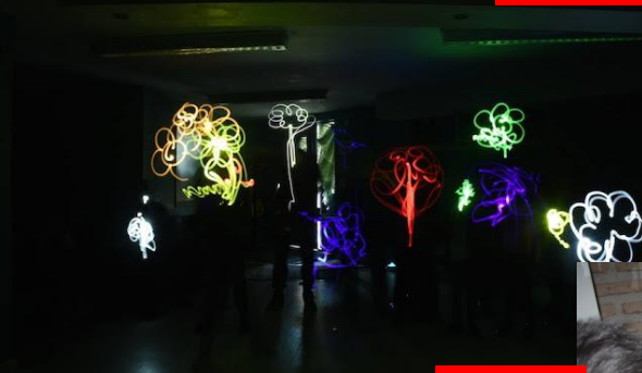
dots & lines workshop