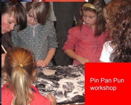
Pin Pan Pun workshop