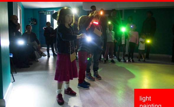
light painting workshop