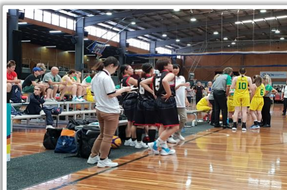
INAS Global Games