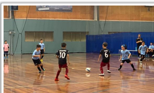
Some great Futsal action

We have also had a 'facelift' with the painters giving the stadium a fresh coat of paint to spruce her up!