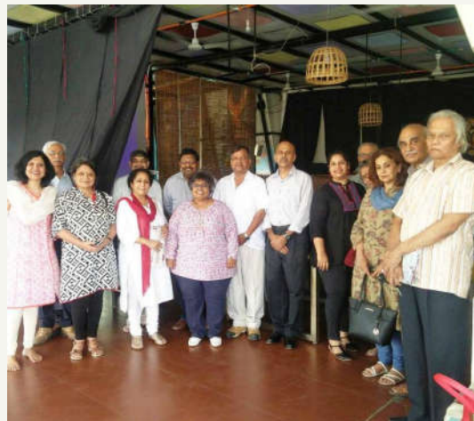
Enthusiastic participants pose for a group photo