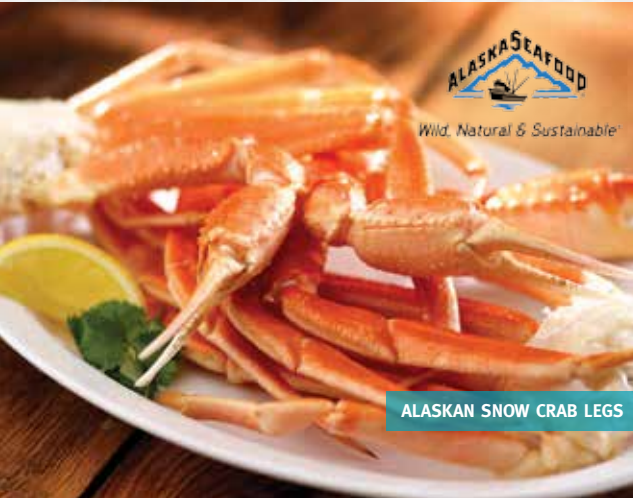
ALASKAN SNOW CRAB LEGS

ALASKAN SNOW CRAB LEGS Deadliest Catch™ approved! But seriously, you are about to bite into crab legs that are shipped to us from the frosty banks of Alaska and served up right with a side of butter. Makes you feel kinda fancy, doesn't it? 11LB 24.99