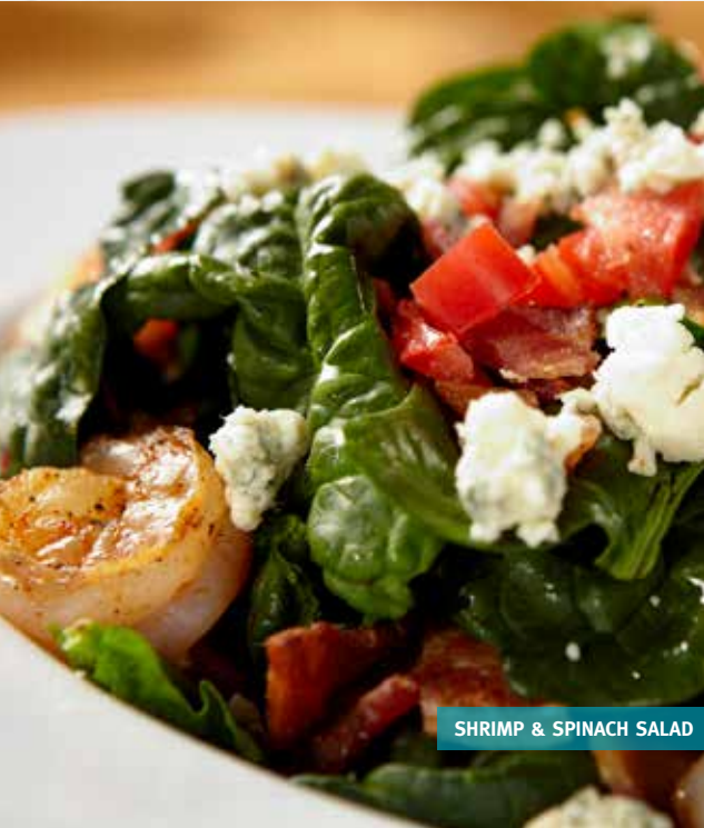
SHRIMP & SPINACH SALAD

CHICKEN CAESAR SALAD Fresh chopped romaine, Parmesan cheese and crispy seasoned croutons with a creamy Caesar dressing. Topped with grilled or fried chicken. 15.99 Hold the chicken 13.99