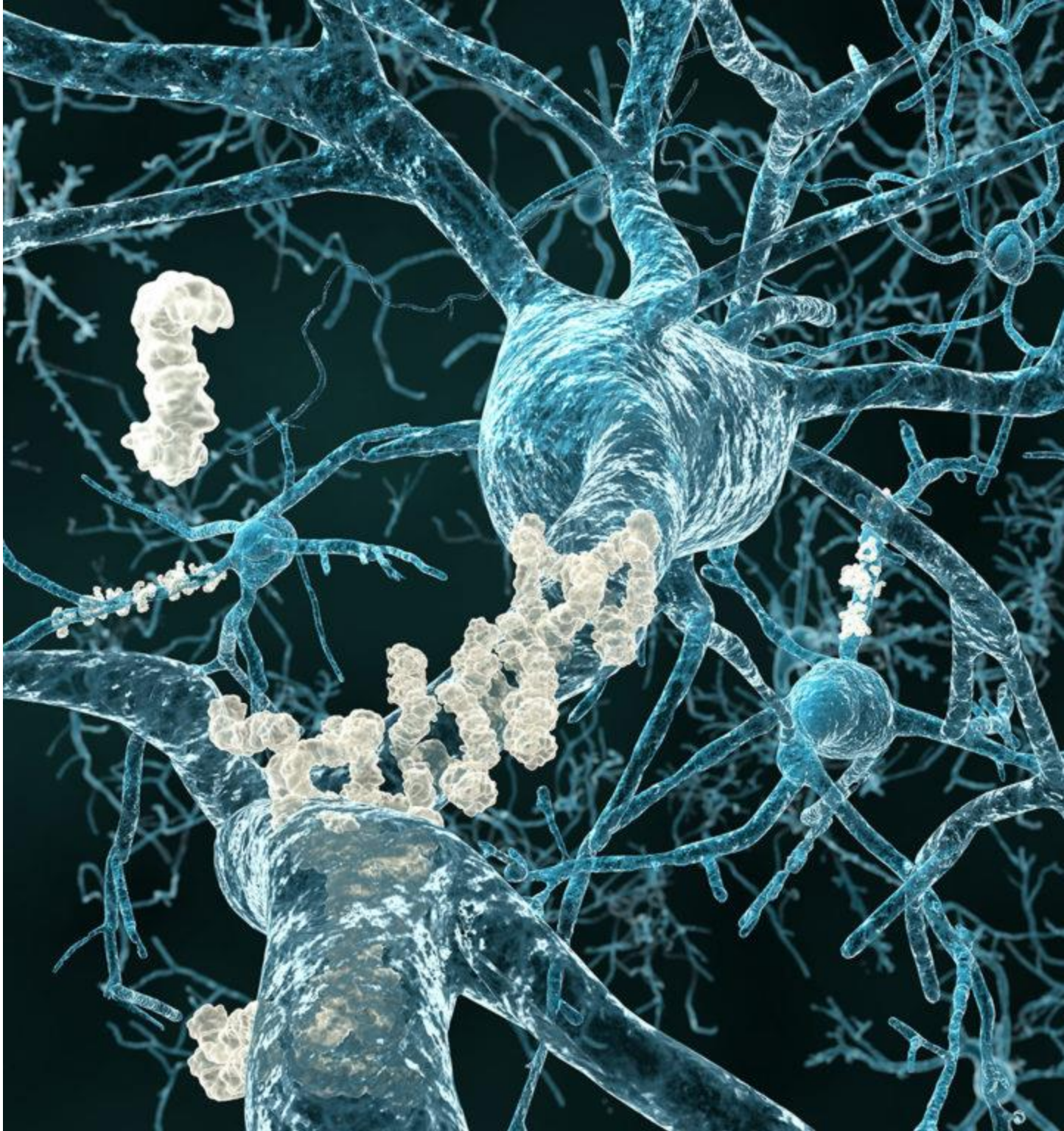
Hippocampal neurons are severely affected by Alzheimer's, and CBD may reverse this effect