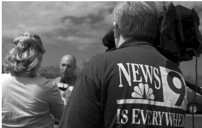
WTOV News, Steubenville, Ohio